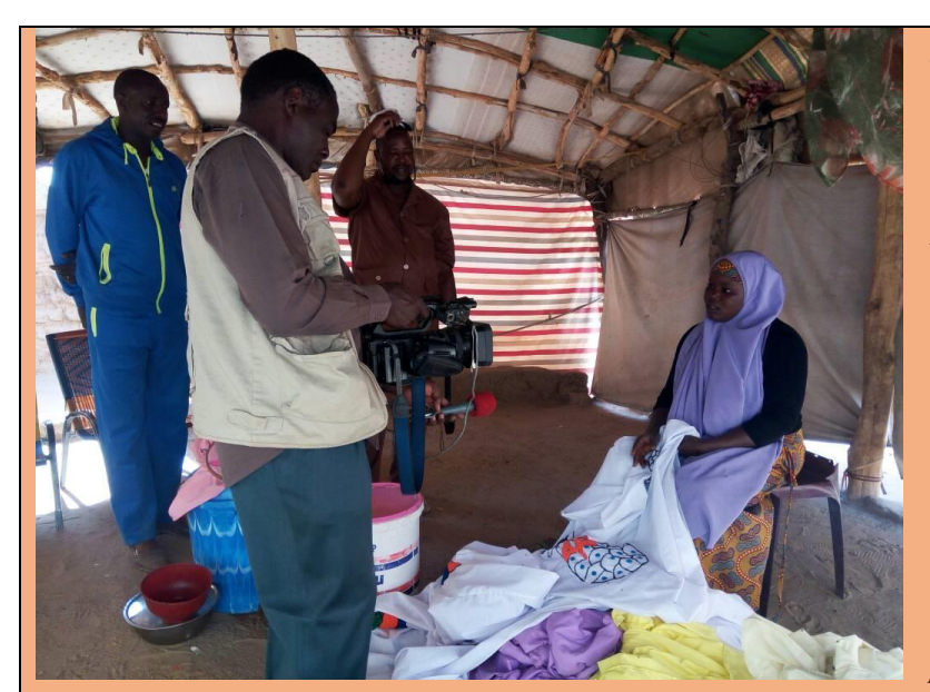
Figure 6: Ms; Sanda being interviewed by the project team

During field visits, beneficiaries have demonstrated great satisfaction for the support provided to them from the Government of Luxembourg. Meanwhile, the needs remain acute for socioeconomic and employment opportunity to reduce populations' vulnerability, and increase their resilience so they are better equipped to face daily challenges.