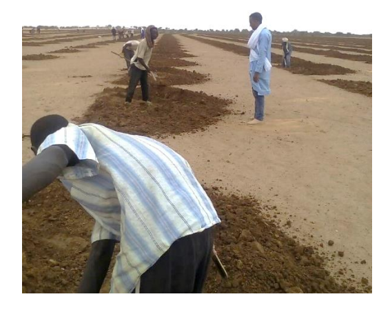
Figure 4: High Intensity Labor activities in Abalak; Young men trenching half-moons to fertilize the soil for farming and/or grazing

Although the relevance of the activities selected is satisfactory, their timing (seasonality) had to be taken into consideration in certain cases (see Challenges).