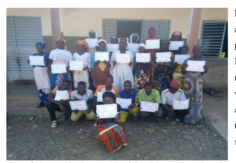
Figure 3: A group of trainees receiving their training certificates in poultry farming

Five hundred (500 of which 430 young women) are young promoters from the Boucle du Mouhoun (mid-West) and North regions were trained and equipped with local poultry farming skills and inputs and thus allowing them to integrate the local poultry sector. This income stream allows them to improve their livelihoods, and subsequently, the local economy. The trainings